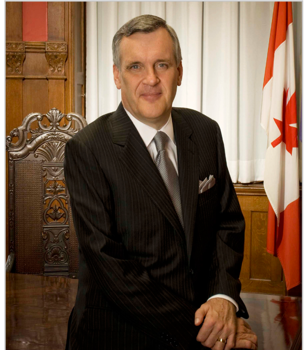
The Hon. David C. Onley, Lieutenant Governor of Ontario

The Honourable David C. Onley was appointed Ontario's 28th Lieutenant Governor following a distinguished career as a broadcaster. His Honour has championed disability issues for many years and served as Chair of the Government of Ontario's Accessibility Standards Advisory Council and was an accessibility council member for the Rogers Centre and the Air Canada Centre. As the first Ontario Lieutenant Governor with a physical disability, Mr. Onley has adopted 'accessibility' as the overarching theme of his mandate. He has defined 'accessibility' as that which enables people to achieve their full potential, and believes that true Accessibility occurs when disabled people can fully participate in the social, cultural and economic life. Because Accessibility includes equal access to opportunities like education, Mr. Onley expanded the Aboriginal Youth Literacy Programs to include computer literacy initiatives. Mr. Onley was born in Midland, Ontario, grew up in Scarborough and was inducted into the Canadian Disability Hall of Fame and the Scarborough Walk of Fame. The Lieutenant Governor of Ontario is the Colonel of the Regiment, Queen's York Rangers, and also the Honorary Colonel of 25 Field Ambulance. Mr. Onley is the recipient of the Rick Hansen Award of Excellence, the Courage to Come Back Award, and holds eleven honorary degrees. CRWDP is pleased to have had Mr. Onley give the opening keynote at the National Launch, and serve as a CRWDP champion.