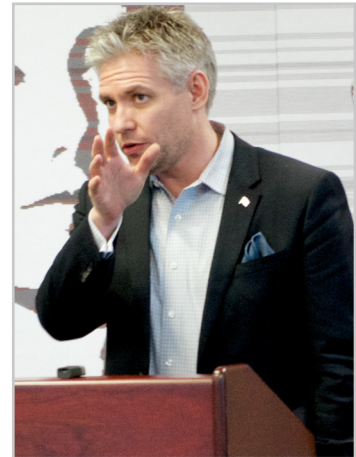
Mike Lake, Member of Parliament for Edmonton-Mill Woods-Beaumont, speaking at the launch.